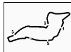
Enzo e Dino Ferrari 4.909 m